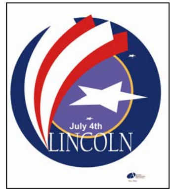
July 4 T-Shirt Designed by Don Alden

Location: Brooks Field on Ballfield Road