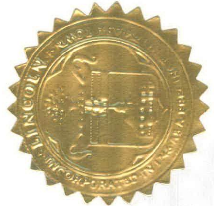
Valerie Fox Town Clerk