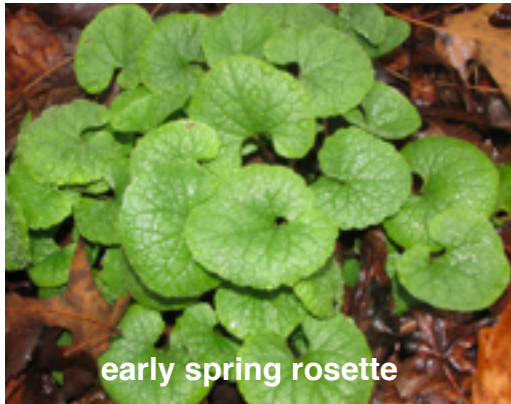
early spring rosette