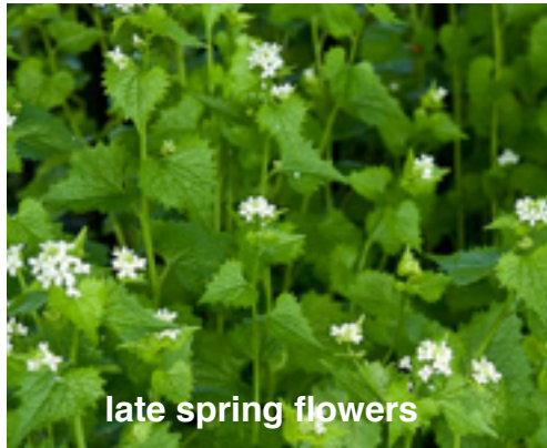
late spring flowers